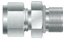
SAE Male Connector UMCS