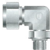
Positionable SAE Male Elbow UMES